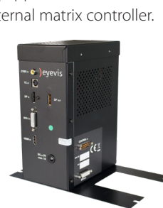
Inputbox for EC-2004 (optional)

All electric, optical and electronic components as well as the cooling system are integrated completely into a closed projection unit including a network interface and colour control (ACT-internal). This unit can be inserted into or removed from the cube housing in a few simple steps. This speeds the setup and reduces the downtime during maintenance. Through an optional inputbox the cubes from the 2004 series can be equipped with additional connectors for inputs and outputs, and an internal matrix controller.